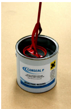
Mix thoroughly with a spiral mixer used in a cordless drill

MIXING Epoxy resins and hardeners must be thoroughly mixed in the correct ratios to ensure complete curing of the product. Each can of SAFEGUARD TSF is supplied with the correct amount of hardener, all of which must be added to the can of resin and mixed well immediately before use. Do not try to accelerate or retard setting of the material by varying the amount of hardener used as this will cause the coating not to set at all, or to prematurely fail. Thorough mixing is also critical to the correct curing of the product and although small packs can easily be mixed by hand, a spiral mixer used in a pneumatic or cordless drill is essential for mixing larger packs. Once mixed SAFEGUARD TSF will remain usable for between 30 and 90 minutes, depending on the ambient temperature. Pot life can be extended by pouring the mixed material into trays which will allow the exothermic heat generated by the curing reaction of the resin and hardener to dissipate. If a small amount of material is required the components must be accurately weighed in the proportions shown on the hardener label. Because solvent must not be added to this material it should not be applied when the ambient temperature is less than 12°C.