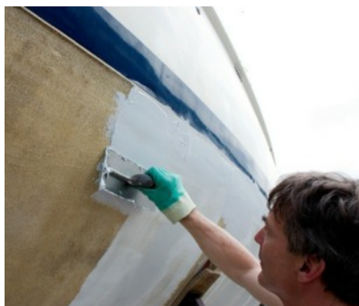
Easy Fair fillers are quick and easy to apply

Both grades have a working life of 25 minutes at 20°C and can be sanded after 2½ hours to an extremely smooth finish and to an imperceptible edge.